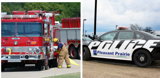
50% will be invested in public safety services, including police, fire and rescue

The majority of 2020 budget dollars (approximately 74%) will be used to provide public safety services, such as police, fire and rescue, and public works services, such as snow plowing, road maintenance, and similar work. The remaining amount (roughly 26%) will be used to: pay down existing debt, finance General Government's day-to-day operations, operate a Community Development Department, and maintain the Village parks. Percentages* for each area are shown below.