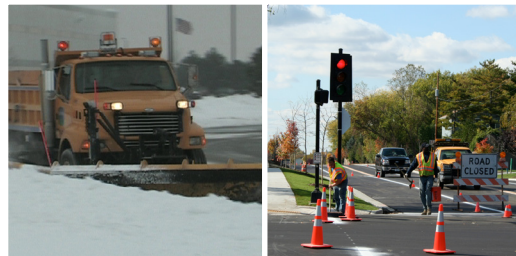
24% will be invested in public works services, such as snow plowing, road maintenance and similar work