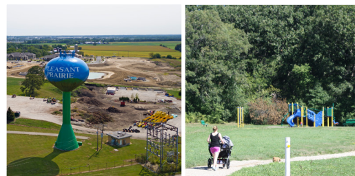
5% will be used for the Community Development Department and the Village parks system