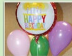
A CHANCE TO WIN A FREE B-DAY PARTY!