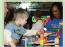
RAFFLE PRIZES & MORE!