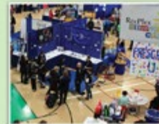
OVER 50 EXHIBITORS!