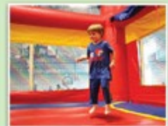
FREE BOUNCE HOUSES!