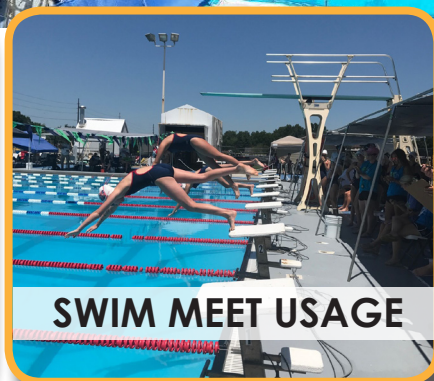
SWIM MEET USAGE