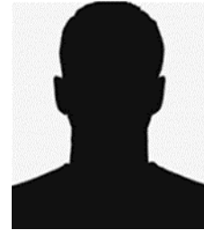
Involved Party Confidential Juvenile (13) Resident of San Bernardino