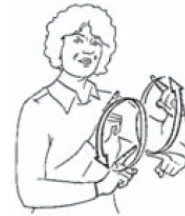
SIGN, SIGN LANGUAGE