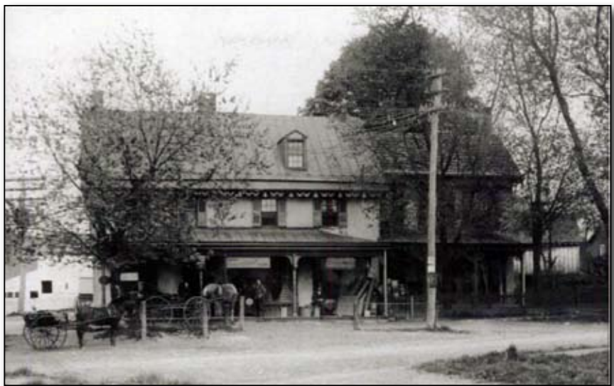
McMahon's General Store, located at the corner of Welsh Road and Huntingdon Pike, was Bethayres' Post Office from 1850 until 1960.