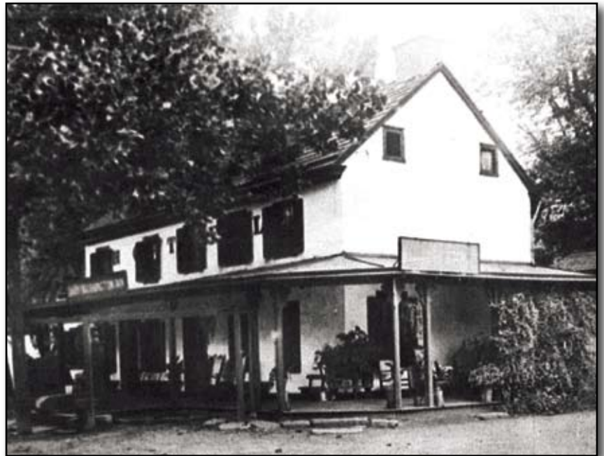
The Lady Washington Hotel, 2550 Huntingdon Pike, was the first Huntingdon Valley Post Office, in 1823.

post offices and villages as people did not travel very far from where they lived. For example there was a post office for Bethayres PA at the corner of Huntingdon Pike and Welsh Road while the post office for Huntingdon Valley PA was half a mile up the hill at Red Lion Road and Huntingdon Pike. Other post offices included one in the village of Terwood PA (formerly Yerkesville) at Paper Mill Road and Terwood Road and Woodmont PA which was next to where Piero's is today, near the Pennypack Trail and the Woodmont neighborhood. There may have been one too at Sorrel Horse which was a village at Byberry Road and Huntingdon Pike. There was a time when just two post offices were left and merged together to form the longest post office name at the time in the US Postal Service - the Huntingdon Valley - Bethayres post office.