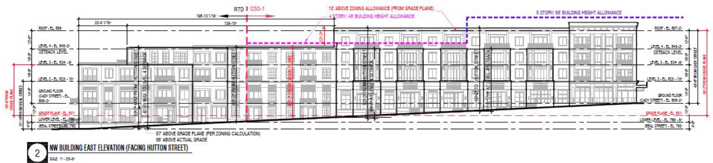
Illustration “B” – Condominium Building Height