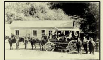
San Ramon Stagecoach