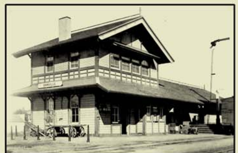
San Ramon Depot